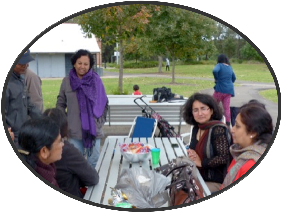
Chatting over a cup of tea

A new Executive committee was elected in the Annual General Committee Meeting held on Sunday, April 27, 2014.